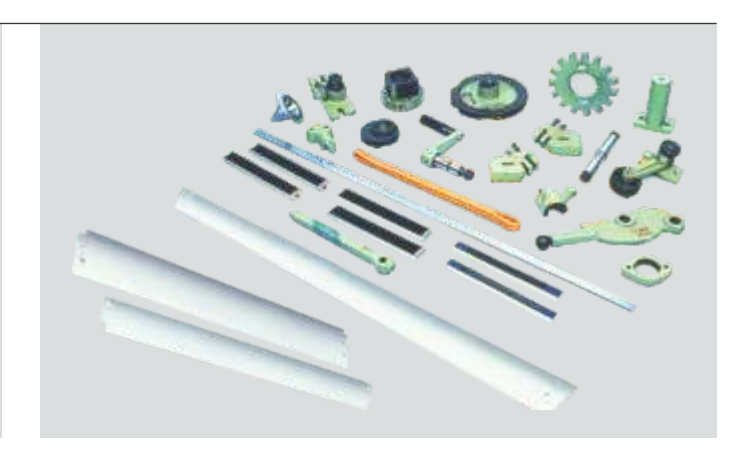
Carding Spares For Rieter, Lakshmi Rieter, Truetzschler, Toyoda, Howa, Platts, MMC Machine etc.

Proven and Tested Carding Undercasing from GALAXY is used by Many Customers Worldwide .