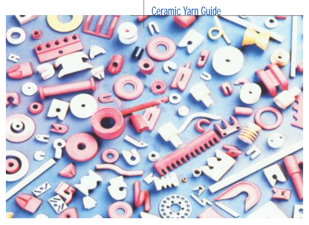
Complete Range of Ceramic Products for all type of Spinning Application