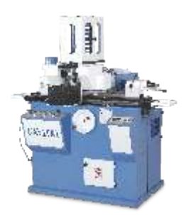
Cot Grinding Machine (Model GCGHY 200-AF)