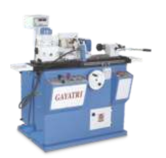
Cot Grinding Machine (Model GCGHY 200)