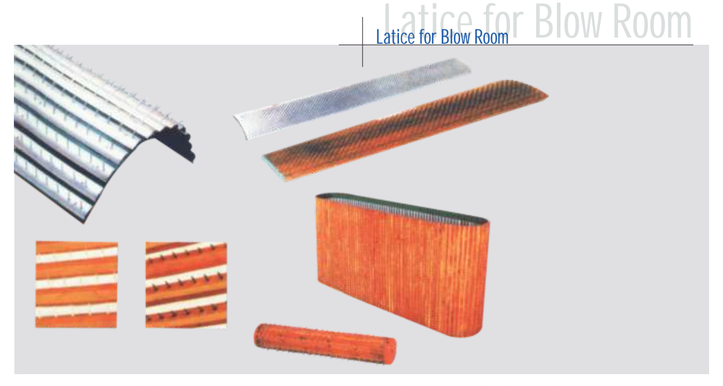
Spiked, Beater & Feed Lattice Made from Wood & Aluminum for all makes of Blowroom

Carding Undercasing from GALAXY is available for almost all make and models of Carding Machines like Rieter, Lakshmi, Trutzschler, Crossrol, Marzoli, Platts, Toyoda, Howa, Mmc, Whitein etc.