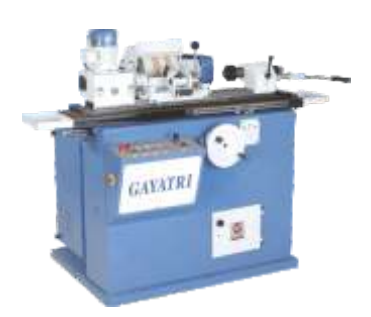
Cot Grinding Machine (Model GCGH 200)