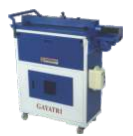
Flocked Clearer Roller Cleaning Machine