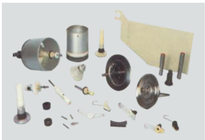
For Volkmann / Star Volkmann, Murata , Veejaylakshmi etc. TFOT Machines