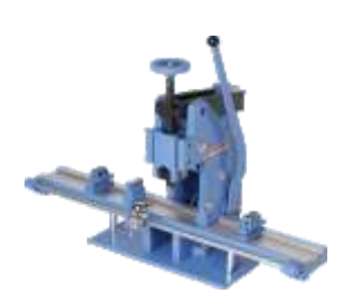
Fluted Roller Truing M/c.