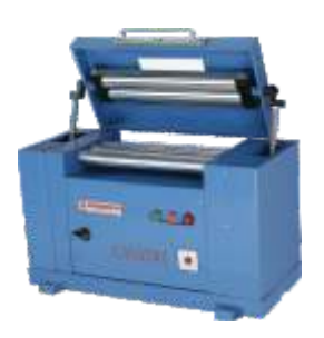
Top Roller Calendering Machine